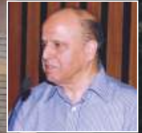
Dr K Kasturirangan (2004-2009)