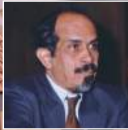
Prof Roddam Narasimha (1997-2004)