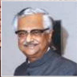
Dr Raja Ramanna (1987-1997)