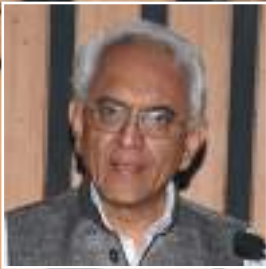
Amb PS Raghavan